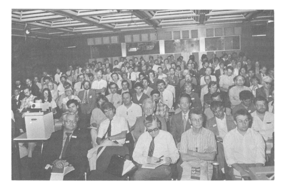
Fig. 2. The lecture hall was crowded during all the lectures, even when the sun was shining outside.